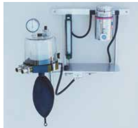
Table plate 13" x 6 1/2", vaporizer mount, 0-5 L/min. flowmeter for oxygen, oxygen flush valve and CO2 Supersorber™. Absorber can be raised or lowered to suit, folds against wall when not in use. Vaporizer sold separately.